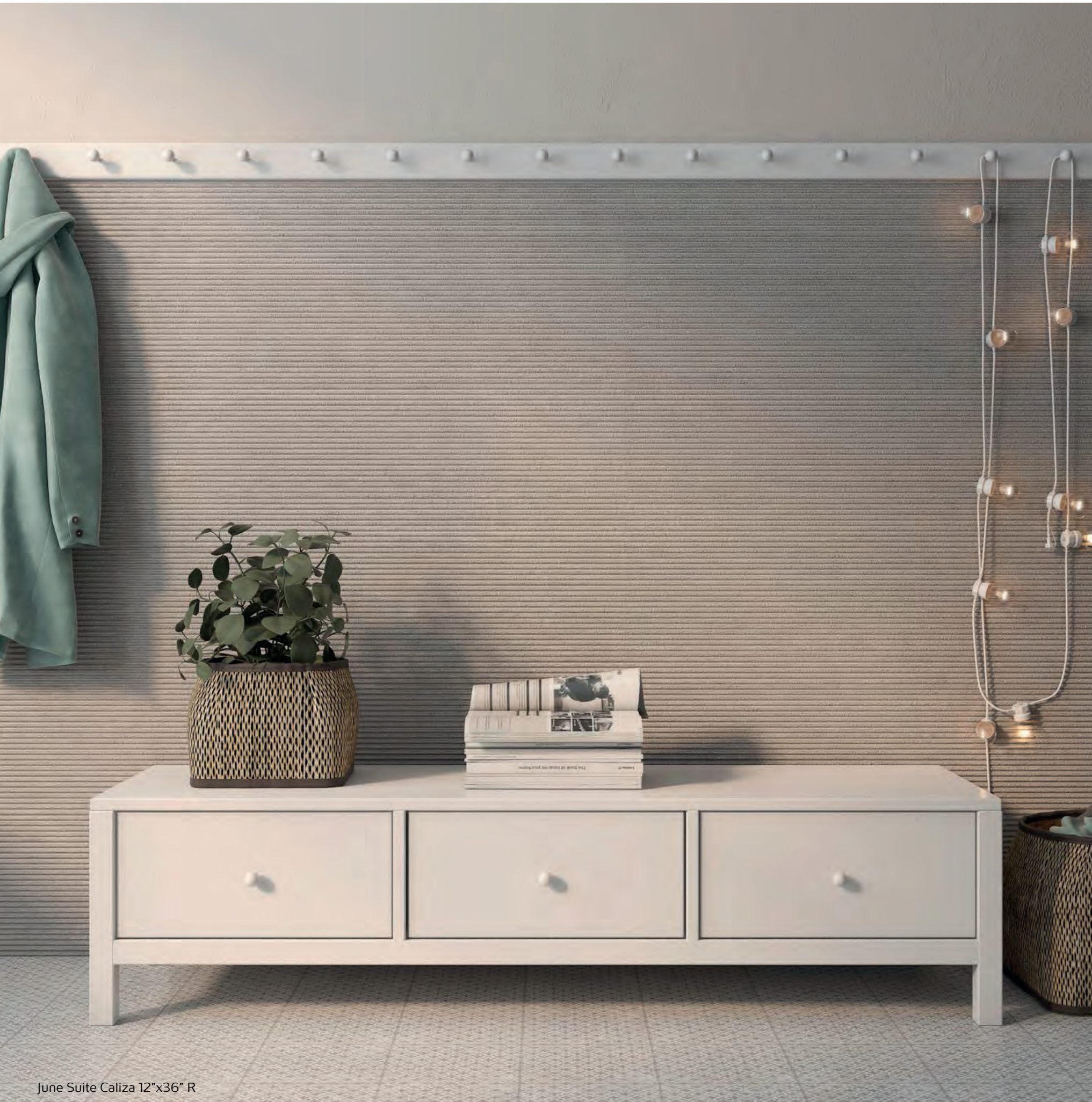
June Suite Caliza 12"x36" R

Lines, touch and color merge into June bringing calmness in its purest form. Its stone appearance fuses a careful printing and relief technique with neutral shades of gray or graphite and subtle flashes of light similar to those generated by the sun in natural stone. Once laid out, it faithfully maintains the appearance of a limestone that brings to mind white and pearly sea sands with a soft, diverse texture and rich in nuances.